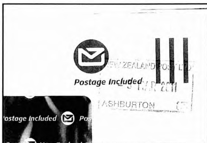
Figure 1: Fragment of window envelope with Ashburton datestamp dated 3 MAR 2011

the stamps were not tied by the postmark. Perhaps it was because, at that stage, they were still