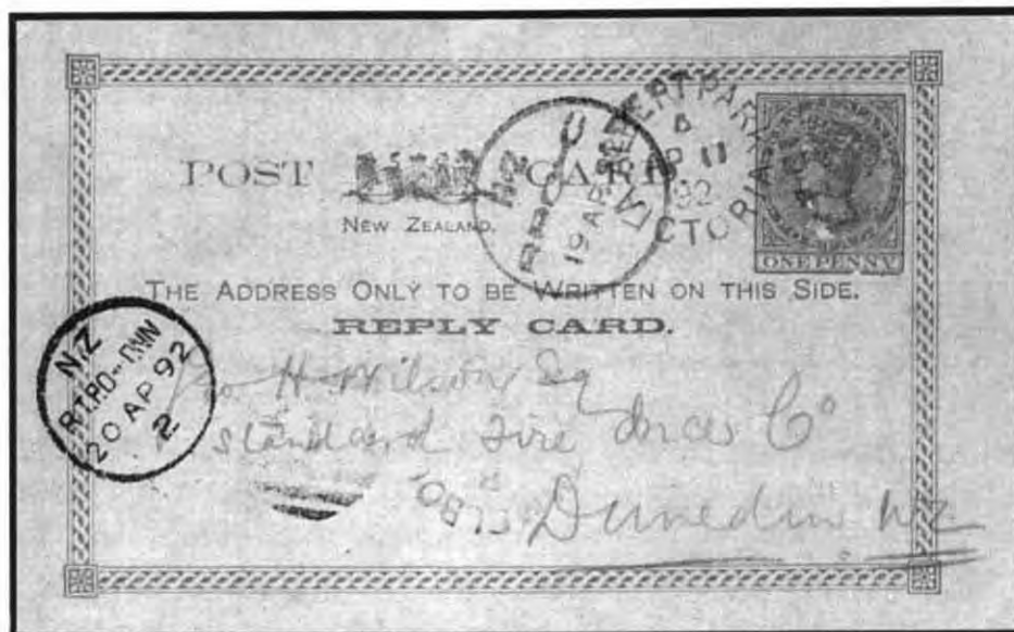
Figure 1: A Reply Paid card used from Australia in 1892