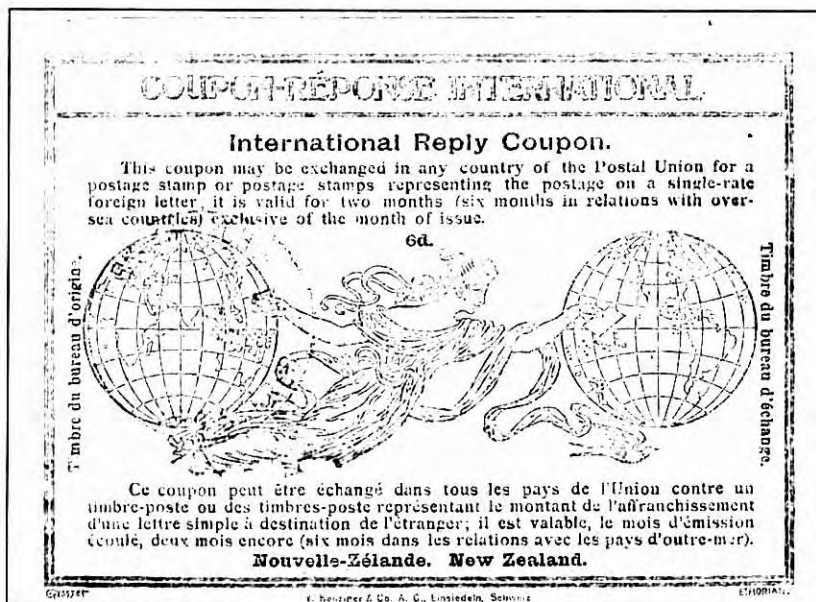
Figure 2: Rome UPU Congress Design Front

The cost and value remained unchanged until January 1, 1912 when it was increased to 6d (Figure 2)