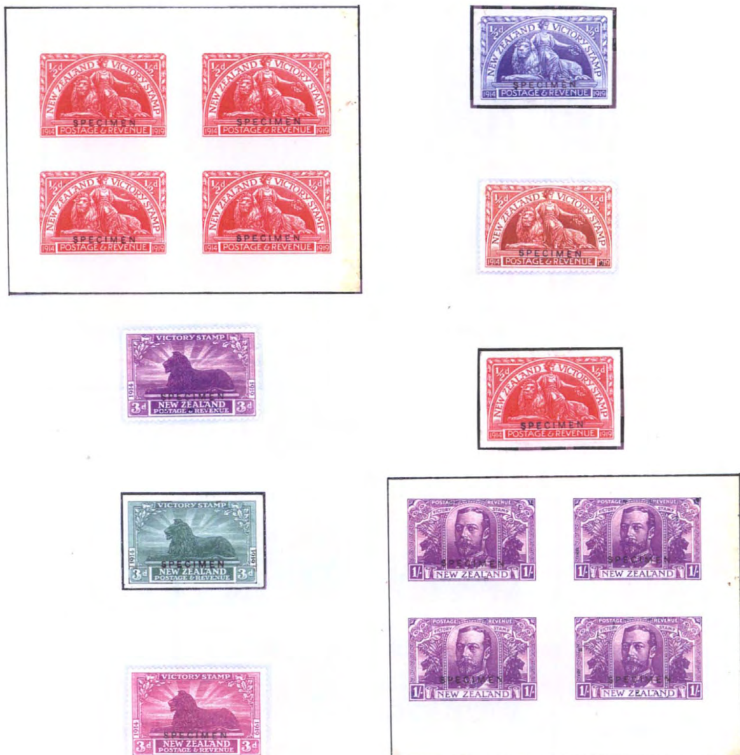
Figure 5 The Colour Trial Plates The Colours used