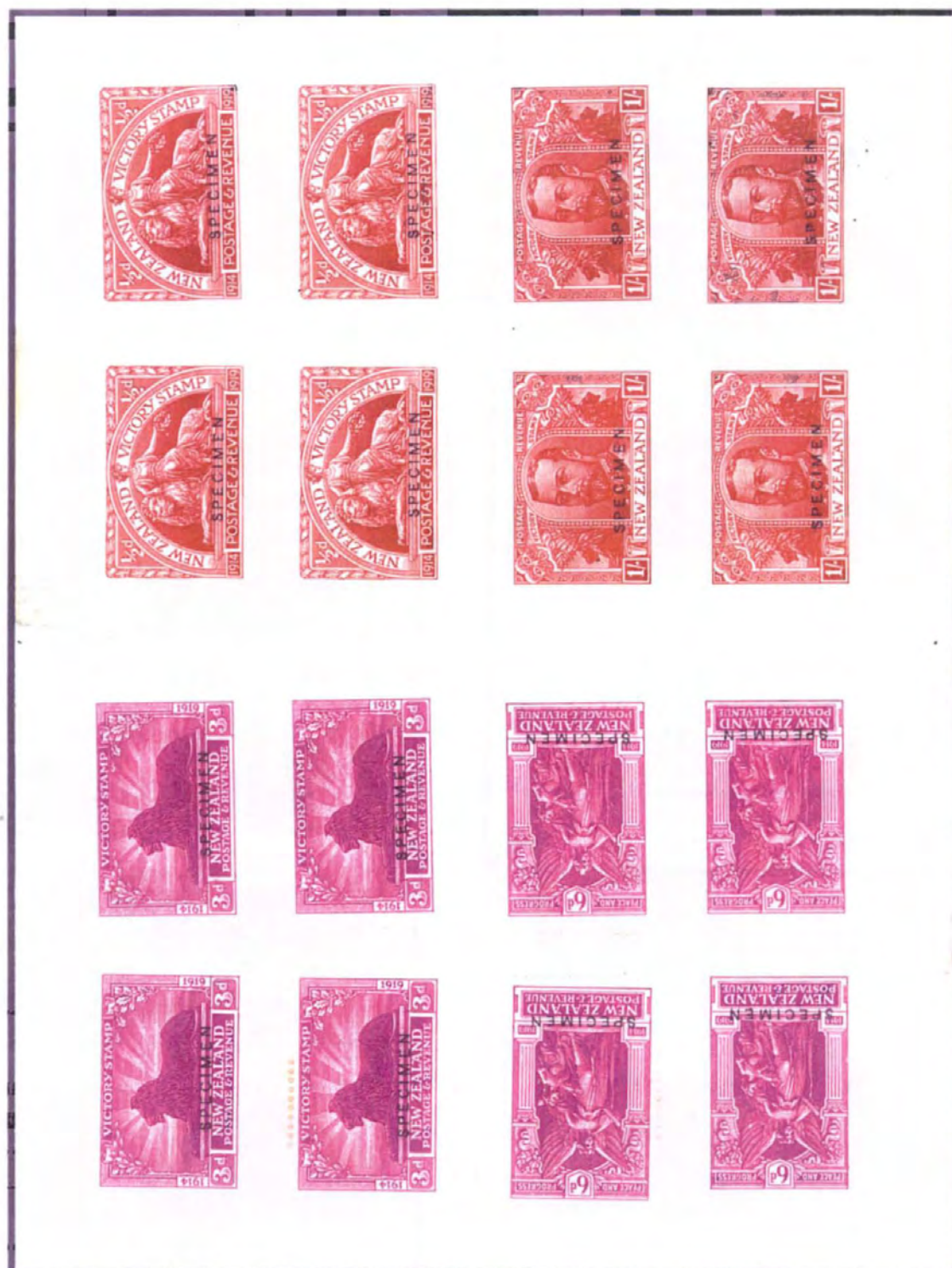
Figure 3 The Colour Trial Plates Composite Sheets made up of strips, pairs and singles. No Watermark, gummed. SPECIMEN overprint Type B (deep 'v' in 'M')