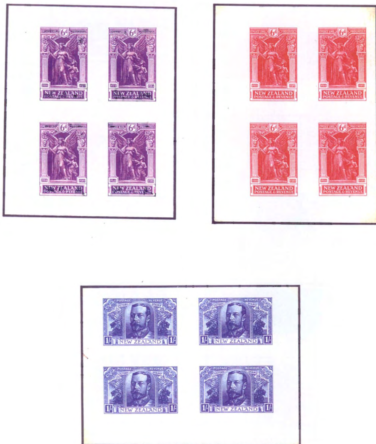
Figure. 6 Imperforate Blocks with no SPECIMEN overprint on unwatermarked paper