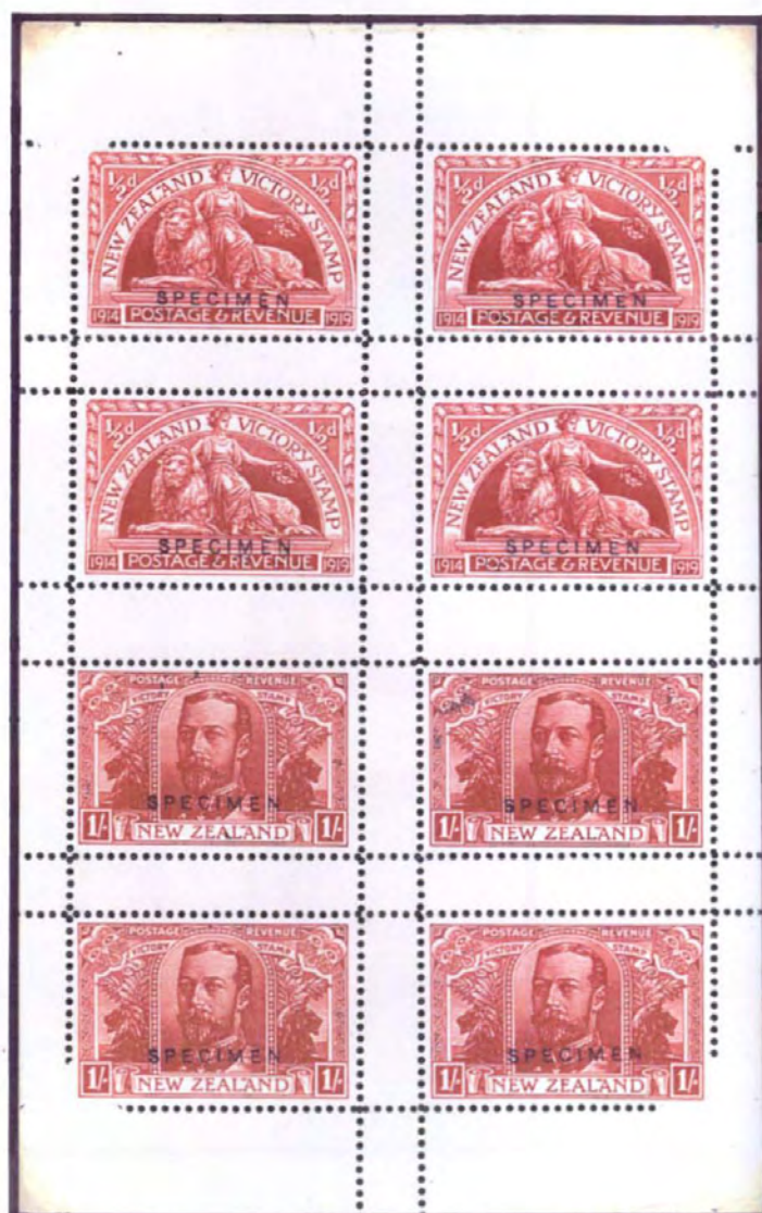
Figure 4 The Colour Trial Plates No Watermark, gummed. SPECIMEN overprint Type B (deep 'v' in 'M')